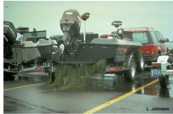
Picture 4. Mat of aquatic plants fixed to a trailer