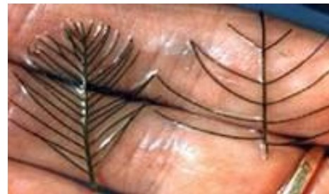
Picture 2. To the left a typical Eurasian watermilfoil leaf and to the right a Northern water milfoil leaf